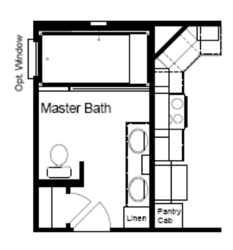
Omit the tub and std. shower, install 8' shower, add linen closet